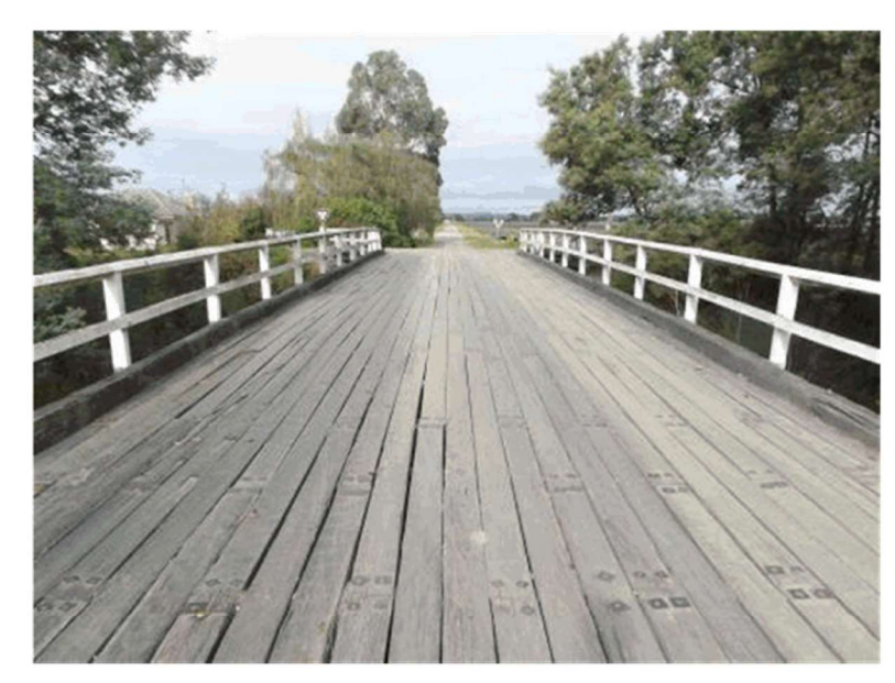
Looking south along Little Rd bridge