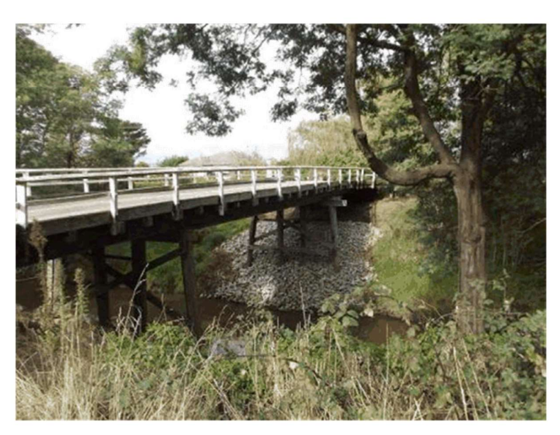
Looking at west side of Little Rd bridge