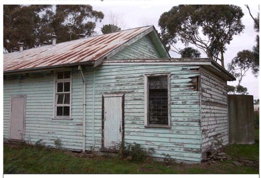
Figure 2 added rear skillion could be replaced or removed, given poor repair

I believe it should be added to the Cardinia Heritage Register and maintained in good condition as an acknowledgement of that role."