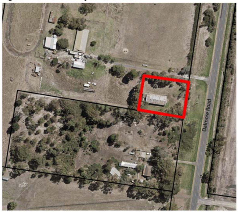
Figure 1. Land affected by the Amendment

The Amendment applies to the land at 231 Dalmore Hall Road, Dalmore as identified by the red line in Figure 1.