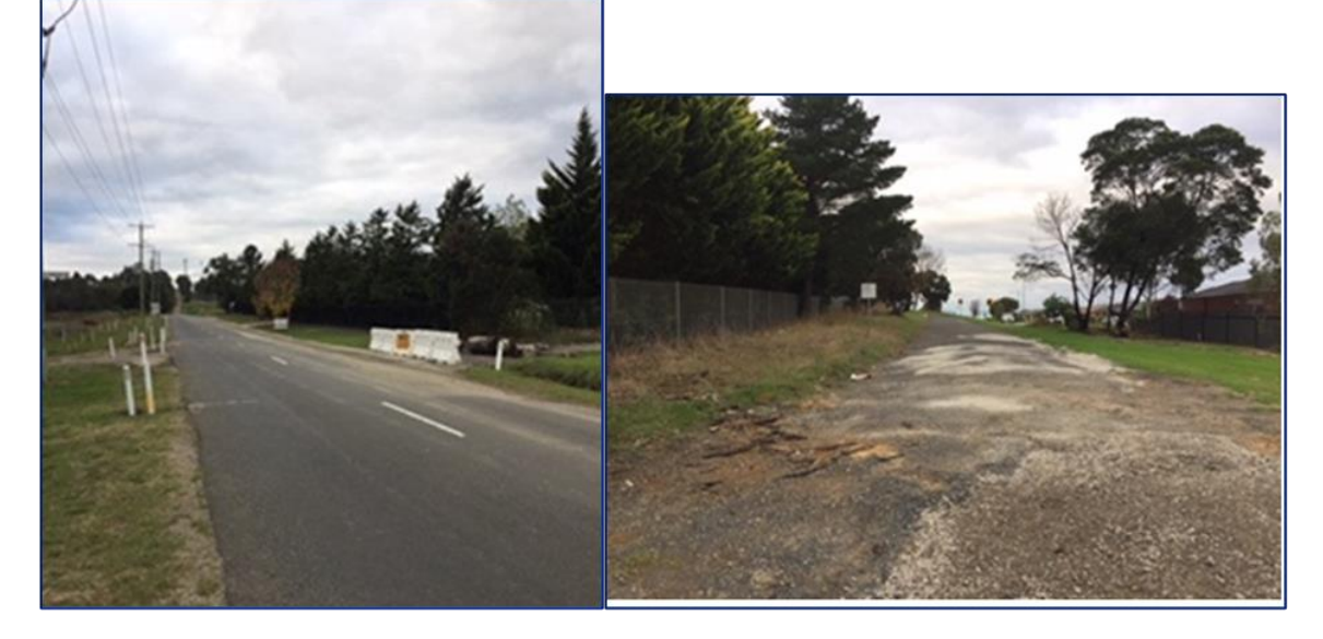
Figure 4. Intersection of Thewlis Road and Mulcahy Road showing current (temporary) road closure and Mulcahy Rd - looking east from Thewlis Rd

The developer of the Mount Pleasant estate will also be connecting (constructing) Moritz Street to Pointer Drive in the near future as works in this development site near completion, see Figure 5.