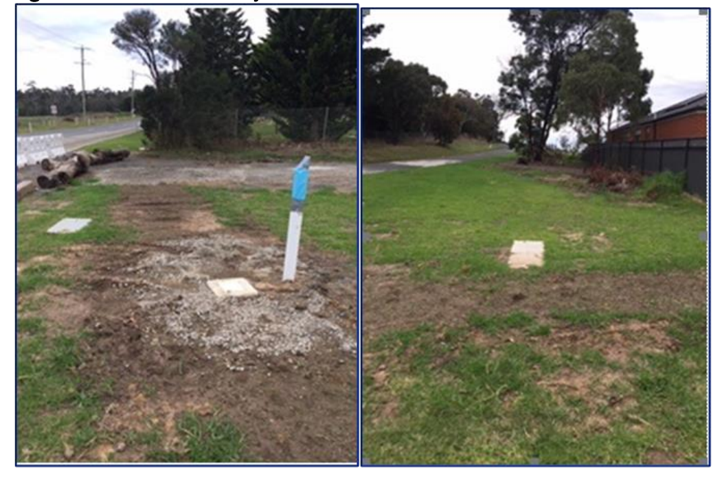
Figure 6. Services in Mulcahy Rd at Thewlis Rd

The Cemetery Committee of Management, which is the 'Department of Health and Human Services', has expressed some interest in acquiring or incorporating part of the road reserve adjacent to the cemetery. This will require a discontinuance. If this is deemed feasible and a portion of road is discontinued, the land vests in DELWP not Council. Therefore, DELWP will be dealing with the land transfer. The length of land to be discontinued is assumed to be the length of the Cemetery- believed to be 221.1 m (1100 links) but to be confirmed. The width is yet to be established but would be dependent on