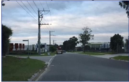
Figure 3. Mulcahy Road looking east near Studd Road

Most of the eastern part of Mulcahy Road has kerb and channel on both sides of the road and underground drainage (this excludes the very eastern section near Toomuc Creek). There is no formal footpath in Mulcahy Road between Purton Road and Studd Road, see Figure 3. A gravel path exists along the southern boundary of Mulcahy Road between Merlot Street and Studd Road. A concrete path has been provided along the southern boundary of Mulcahy Rd between O'Brien Parade and Merlot Street where residential properties front Mulcahy Road.