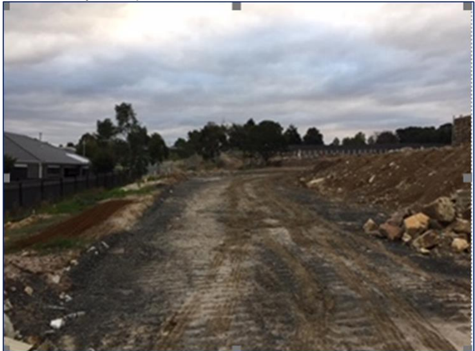
Figure 5. Mulcahy Road looking west to Moritz Street from Pointer Drive- soon to be constructed by developer

The developer of the Worthington Estate (west of Thewlis Road) will be constructing the modified T intersection of Kenneth Road and Thewlis Road in the near future. The new intersection will maintain road priority as per the Cardinia Road Precinct Structure Plan with a local arterial road connection from Thewlis Road (southern approach), to Kenneth Road (western approach). Motorists wanting to continue straight (north) along Thewlis Road will in effect have to make a right hand turn. This can be seen in Figure 7.