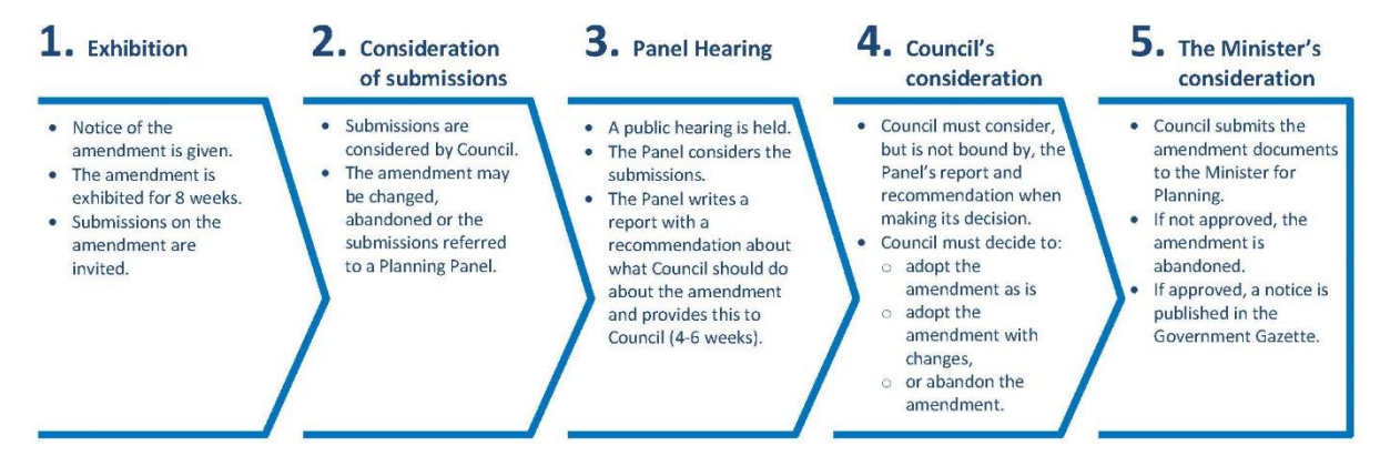
Figure 1 Steps in the Planning Scheme Amendment Process for Glismann Road We are at Stage 2 of the Planning Scheme Amendment process (Figure 1). Matters raised by submissions cannot be resolved and must now be considered by an independent Planning Panel to be appointed by the Minister for Planning. It is recommended that Council adopt the amendment with the changes outlined in Attachment 4. A public hearing will be held and all submissions considered prior to a Panel report prepared for Council.