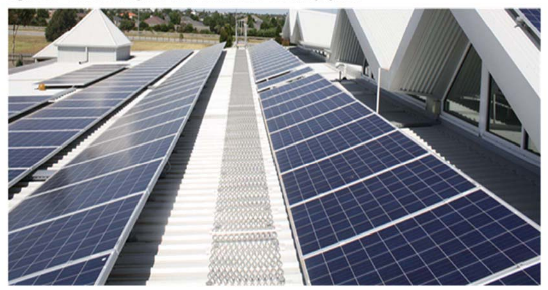
Figure 6. Arena Family and Child Centre solar electricity system