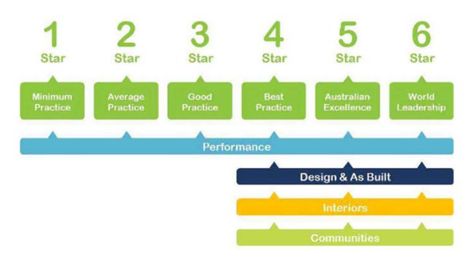
Figure 2. Green Star ratings (Green Building Council of Australia, 2013)

Green Star ratings encourage the engagement of a Green Star accredited professional onto the project team, and require a significant amount of rigour and consultancy work, and are not appropriate for small developments such as toilet blocks and small sporting pavilions. The Green Star process however provides a certified rating and process to ensure that a high level of ESD is achieved through a recognised system. Green Star requires buildings to include a variety of unique and innovative features. Green Star buildings have been shown to produce 62% fewer greenhouse gas emissions than average buildings, use 66% less electricity, consume 51% less water and recycle 96% of their construction and demolition waste compared to standard buildings (GBCA, 2013).