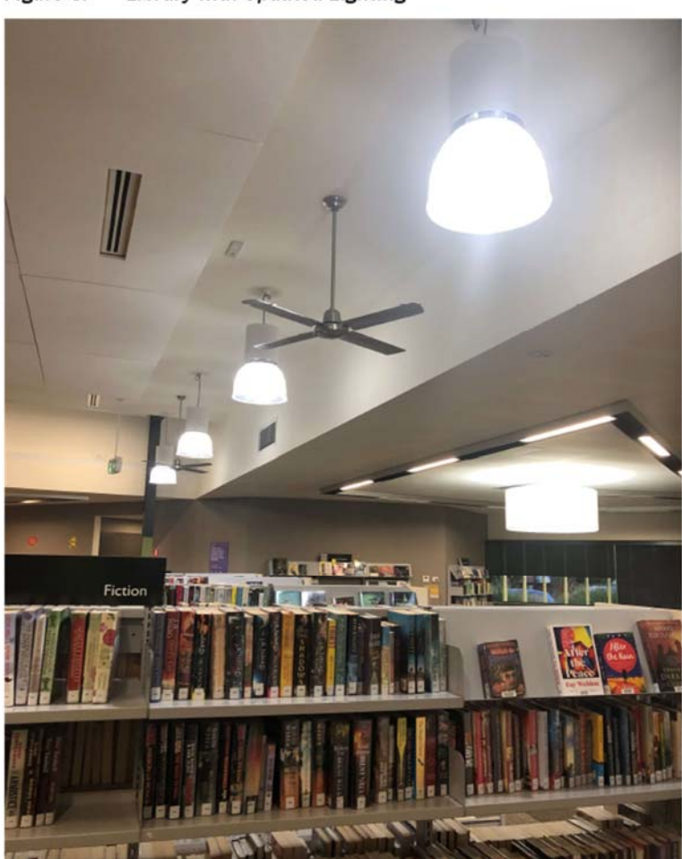
Figure 8. Library with Updated Lighting

Over 600 lights at the library, hall and U3A were replaced with energy efficient LED products. These products reduce lighting energy consumption by approximately 50%. The new lighting has also increased lighting levels throughout the facility, improving comfort and amenity. The replacements included carpark lighting, tubes, dimming systems and downlights. The internal lighting upgrades were integrated with the existing dimming system and indoor architectural fittings to preserve the original building design.