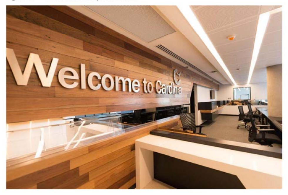
Figure 9. Civic Centre reception counter

The Cardinia Civic Centre includes a range of sustainable design features. The building achieved a 5 star Green Star Design and Operation rating (v3 rating tool).