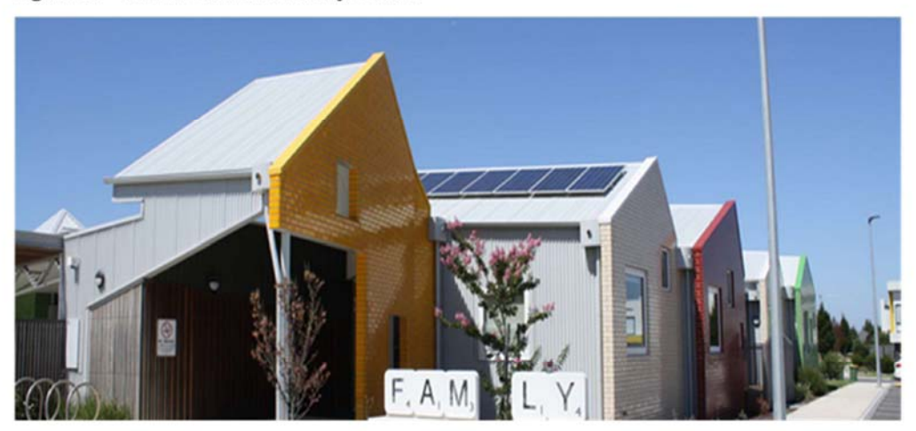
Figure 3. Arena Child and Family Centre

The Arena Child and Family Centre in Officer provides a case study on the benefits of sustainable building design and the significant operational cost savings that it can provide. The Arena centre was one of the first buildings that an early version of the ESD matrix was applied to, and it features a number of sustainable design features.