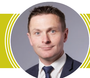
Mayor Cr Brett Owen – RANGES WARD