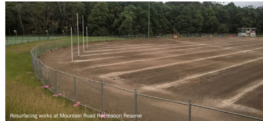
Resurfacing works at Mountain Road Recreation Reserve