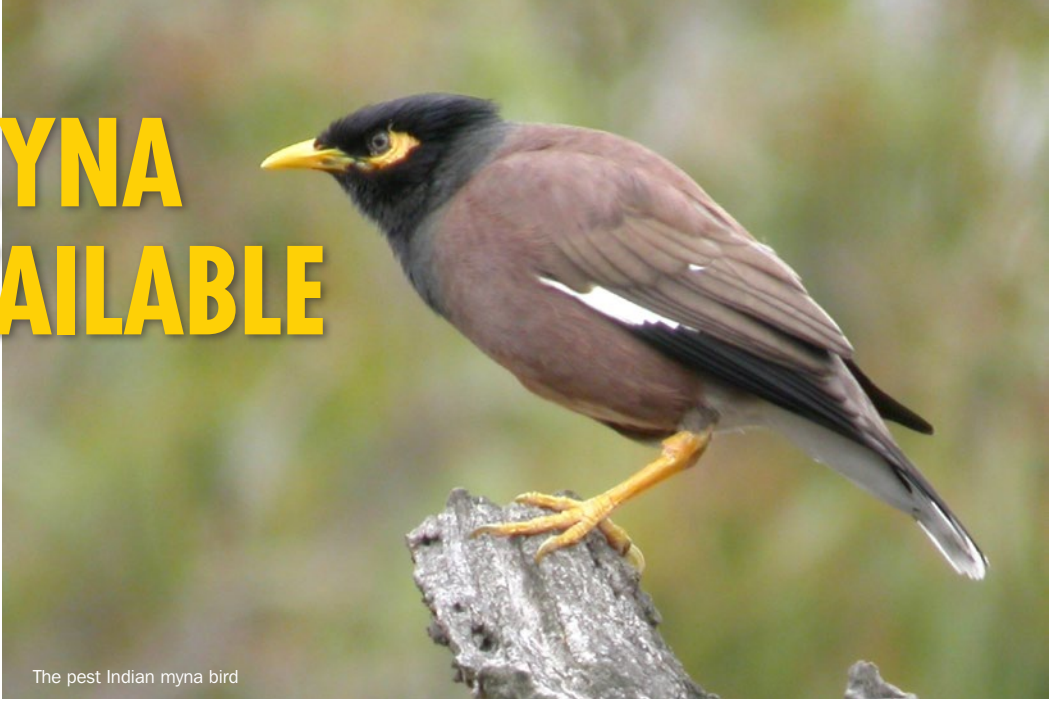
The pest Indian myna bird

Indian mynas also use sticks and rubbish to build nests inside roofs, creating fire