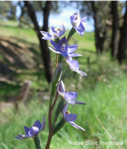
Native plant Thelymitra

Council's weed kit, also now online, has photos and descriptions of some