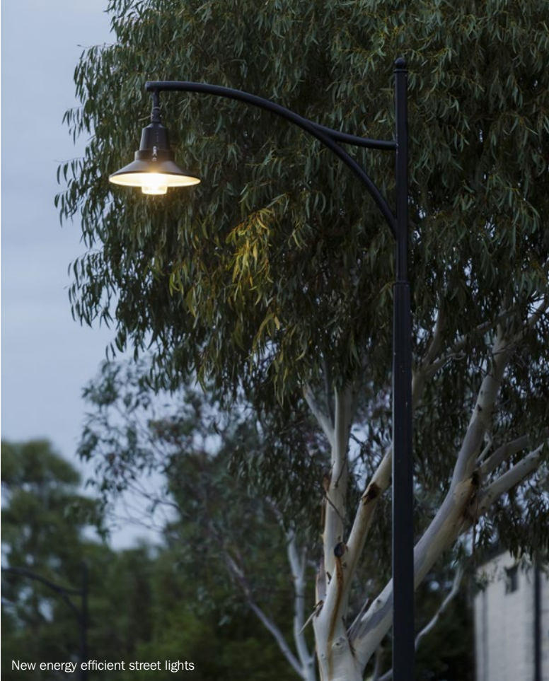
New energy efficient street lights

This is a key action from Council's Aspirational Energy Transition Plan and is part of Council's efforts to achieve a target of zero net emissions for its operations by 2024.