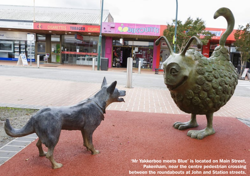
'Mr Yakkerboo meets Blue' is located on Main Street, Pakenham, near the centre pedestrian crossing between the roundabouts at John and Station streets.