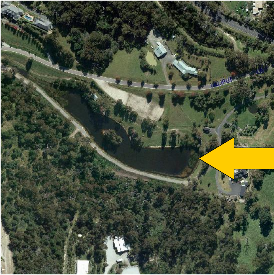
Lilliput Lane, Pakenham Upper