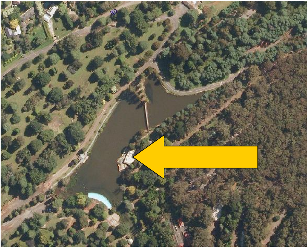
Emerald Lake Park