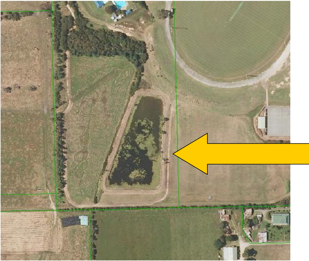
Garfield Recreational Reserve Dam