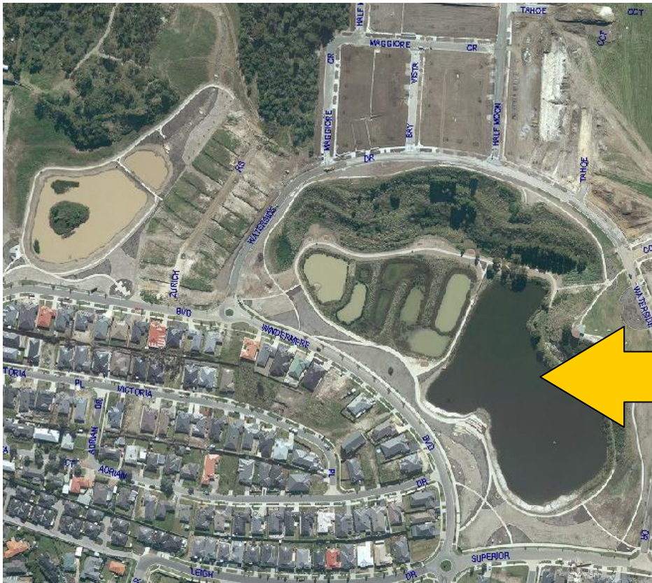
Cardinia Lakes, Windermere Boulevard, Pakenham