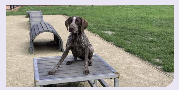
Dizzy at the off leash dog park area at Alma Treloar Reserve, Cockatoo.

Finally, just to finish with a tip, remember to renew your pet registrations by 10 April.