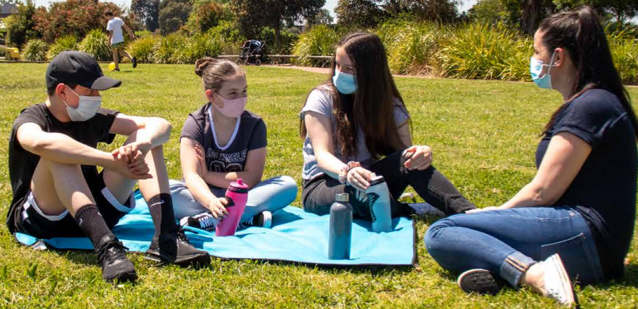
People enjoying our parks and reserves.

With the easing of restrictions, we're pleased to welcome the reopening of many local businesses, the happy sounds of children playing in our playgrounds and people enjoying our parks and reserves.