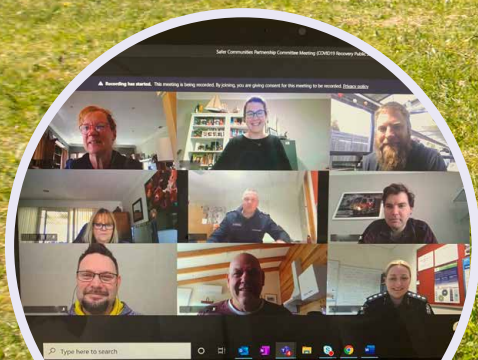
The Safer Communities Partnership Committee is one of the local committees that has been supporting the community during the pandemic.