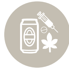
Alcohol and other drugs