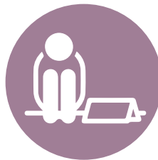
Housing and homelessness