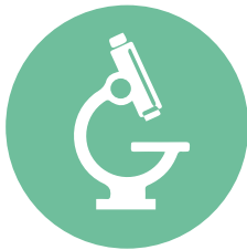
Allied health services

Council had provided a series of seven posters providing information about the following services, in particular the level of service in Cardinia as compared to metro Melbourne plus the service gaps that have been identified by participants in the workshop.