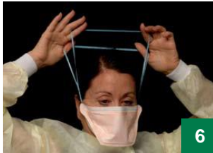
6 Pull the straps up and over your head