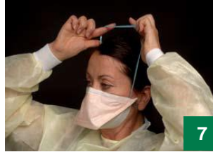
7 Place and position the lower strap at the base of your neck (under your ears)