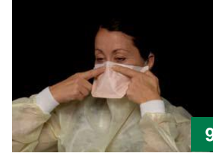
9 Gently press the nose wire down across the bridge of your nose until it fits snugly