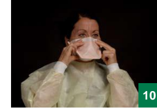
10 Continue to adjust the mask and edges until you feel you have achieved a good and comfortable fit