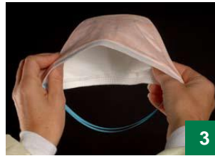
3 Hold the mask upside down to expose the two straps