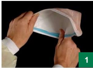
1 Separate the edges of the mask to fully open it