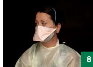
8 Place the upper strap on the crown of your head so that it runs just above the top of your ears