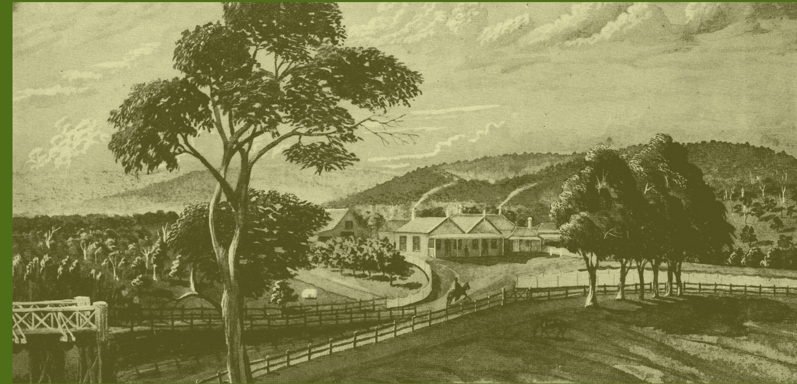
Bowman's Inn (c1860).