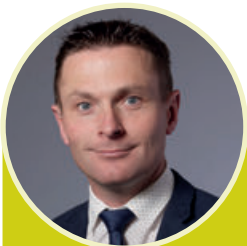
Cr Brett Owen – Deputy Mayor

The upgrade will meet the needs of the growing local community and also provide important infrastructure to support the area as a tourist destination.