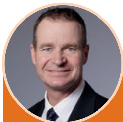
Mayor Cr Collin Ross