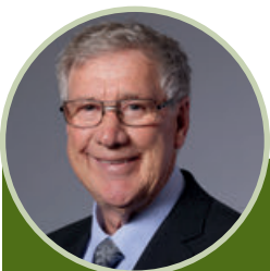
Cr Ray Brown

This project is funded by $800,000 from the Victorian Government and $400,000 from Council. Council is working with the reserve user groups and the reserve committee of management to develop the plans for the remodelling of the pavilions.