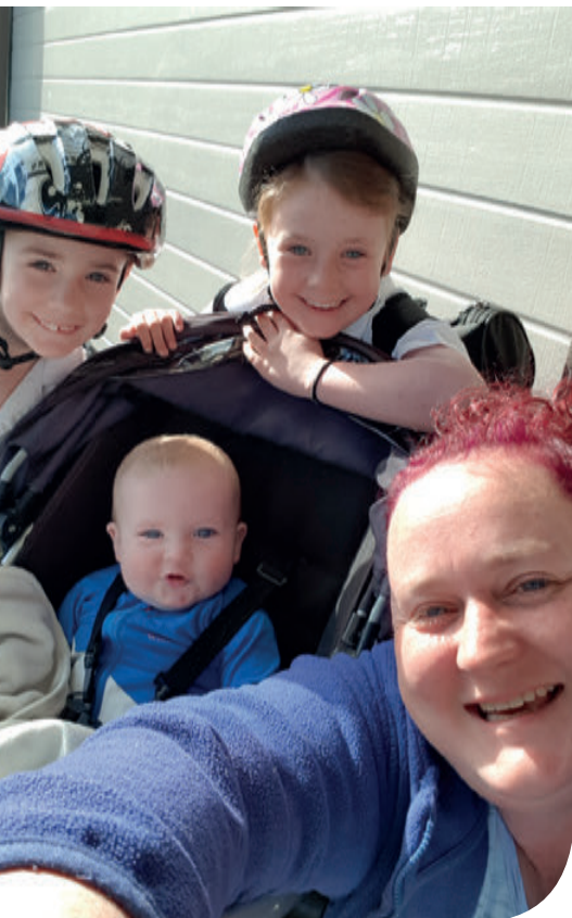
Last year's winning Walk to School selfie!

Council received $1 million in funding from the Australian Government's Department of Infrastructure and $545,000 from the Victorian Government's Growing Suburbs Fund. The remaining funds were provided through Council's Capital Works Program.