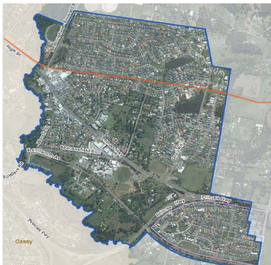
Figure 2 Beaconsfield Structure Plan area